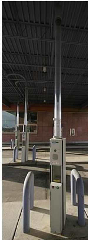
Pneumatic tubes at a bank