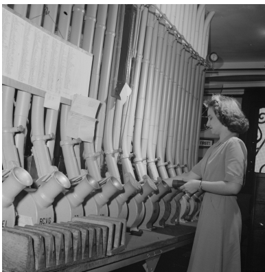
A pneumatic tube system in Washington, D.C. in 1943

In most cases, people still used regular stamps for pneumatic mail. Italy, however, printed special pneumatic stamps between 1933 and 1966. Such subterranean mail tubes operated until as recently as the 1980s, but as cities grew and post offices moved around, rerouting the underground mail networks proved too difficult. The tubes were abandoned in most cities, though Prague still has a few pneumatic tubes in use.